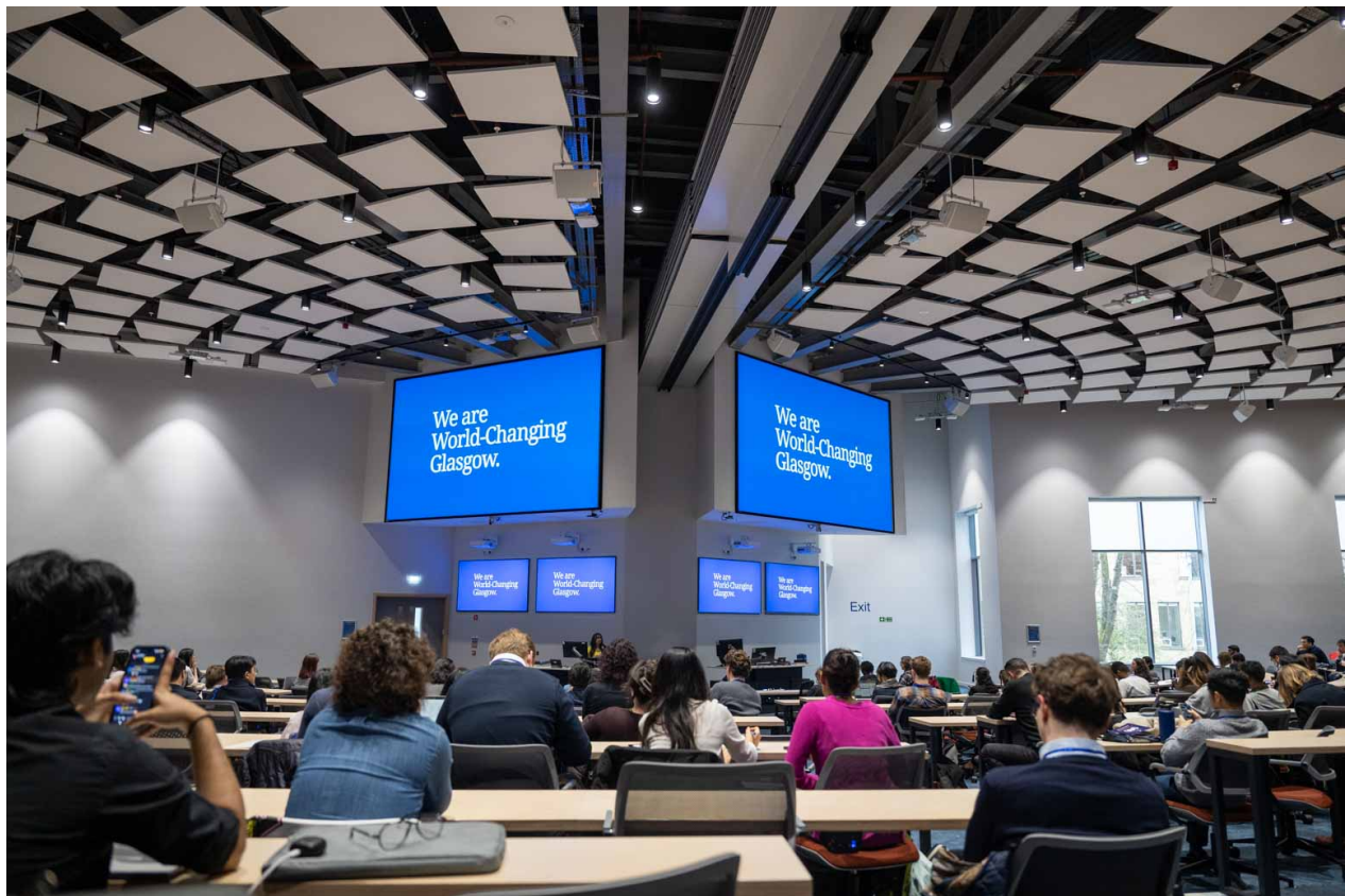
Image: Session at BCUR 2026

Without question, this experience has raised the bar for my professional aspirations in disseminating research. It is a privilege to witness the students' enthusiasm for learning and broadening their understanding beyond their individual research.