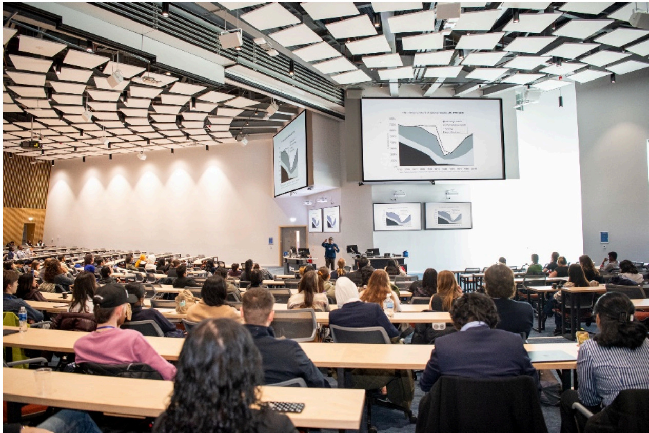
Image: Session at BCUR 2026

bridge between generations - a reminder of the British Council's role as a torchbearer for global academia, and it reinforced my own commitment to academic mentorship.