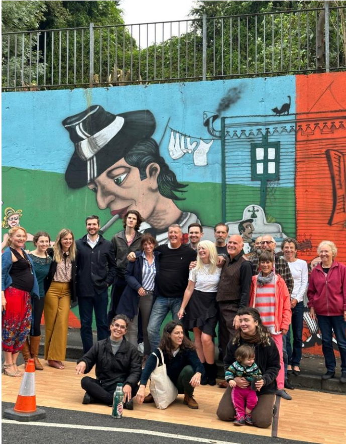
Figure 8: Local tango dancers at the mural's inauguration