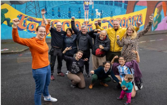
Figure 9: Screenshot of Stockport Council website