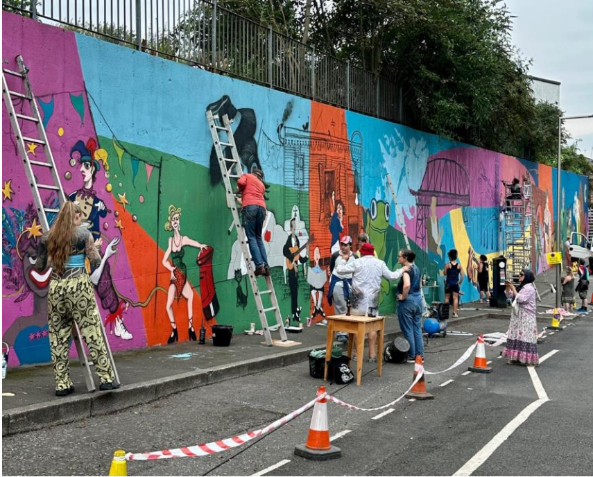
Figure 7: Almost done!

To conclude, a random conversation in a Buenos Aires coffee shop between two Englishmen thousands of miles from home, led to an idea, which led to a meeting, and over the course of only a year became a collaborative intercultural landmark on a quiet backroad in the heart of Stockport. We celebrated its inauguration with a performance of a local tango group (see figures 8 and 9). A mural depicting La Boca and La Stocka, the fruit of the hard labour of storytellers and muralists, local people and visitors – all of these took part to make this exchange a wonderful experience. 3