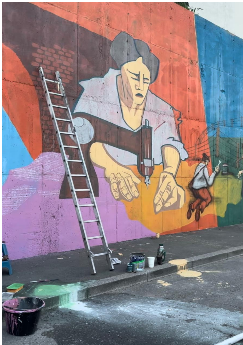
Figure 2: Mural detail: A woman sewing