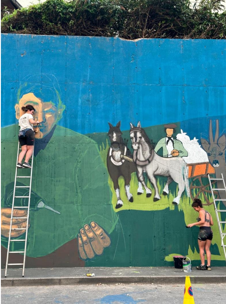
Figure 2: Mural detail: Heavy horses and industry