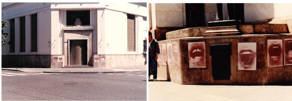
Picture 13 & 14: Heliography on offset paper (1993). Signalling of Banco Provincial de Santa Fe in Rosario, Argentina. From the series Bocanada .

fraud and embezzlement were set free in 1993 and the bank was ultimately privatised, costing the province economic damages of more than 500 million dollars ( Rosario12 2013, n.p.). In 2013, those charges were dropped due to their alleged prescription, and even now, in 2023, thirty years since the bank’s union members made new charges against those released, there are still requests to end the impunity (Aguirre 2023, n. p.). Undoubtedly, Sacco’s ‘interference’ of this bank was premonitory of what happened in December 2001, when the nation’s whole banking system collapsed. It was an unusual action for her at that point: it did not correspond exactly to the themes she was working on at the time, but her assistant explained that the nature of the white-collar crime – bureaucrats saved by a perverse system that punished the workers – urged them to go out to visibilise/externalise what happened indoors. They pasted many posters, but the police, whose presence was extensive at that moment due to the corruption scandal surrounding the entity that had led to the gathering of significant media attention outside the building, forced their removal (Belén Antola, personal communication).