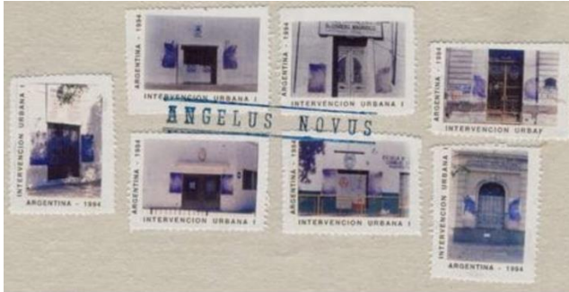
Picture 7: Mail Art, postal action. From the series En peligro de extinción (1994).

p. 249). Hence, Sacco's rubberstamped mark can be understood to imply the same doomed destiny for the schools in question.