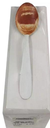
Picture 9: Heliography on metal spoon mounted on wooden block (1994). From the series Bocanada

Her second official urban action, labelled Intervención Urbana II [ Urban Intervention II ], this time from the series Bocanada , also took place in 1994, upon approval of the constitutional change that allowed the re-election of Carlos Menem, and which started the publicity campaign that led to the 1995 presidential elections. She pasted posters of her open mouths over different billboards containing campaign slogans across the city of Rosario, urging people to look beyond their empty promises.