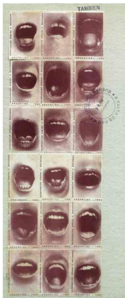
Picture 15: Heliography on stamps. Postal art (1993-1994). From the series Bocanada (1993-2023). Photograph