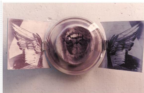
Picture 8: Heliography on bread and wooden board (1993). From the series Bocanada .