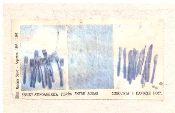
Picture 6: Mail Art, postal action. Heliographed stamps of the series ‘Latinoamérica, Tierra entre aguas’, created for the exhibition 500 years of repression at Museo Sívori, Buenos Aires, 1992.

and ownership that have been taking place since the Conquest. The phrase ‘Latin America, land between water’ frames the soil, itself placed as if ready to be consumed or to be lost, drifting away in those predatory waters.