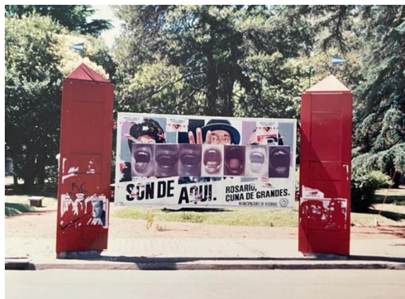
Picture 16: Heliography on offset paper. Street intervention in Rosario (1994-1995). From the series Bocanada (1993-2023). Photograph