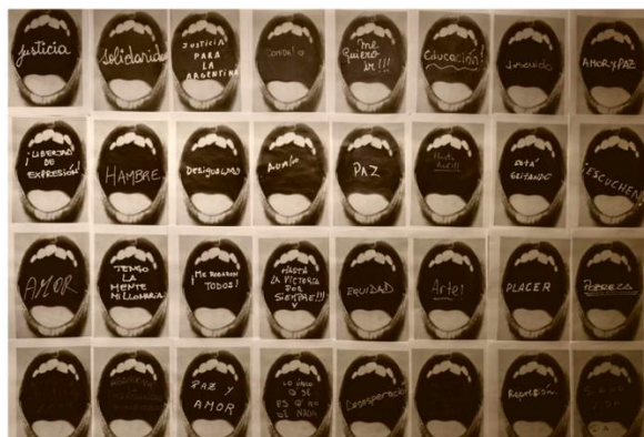
Picture 19: Project Sacco Afuera (2018).

Sacco's artistamp sheets from Bocanada show, as do the different spoons installations created and the multiple poster interferences produced, the artist always used an archive of different people's mouths in order to 'search for the points in common of different stories' ['busco el cruce de historias'] (cited in Giunta 1994, p. 77) and show a plurality of voices. She tried to avoid pasting two mouths from the same person together (personal communication). The members of Sacco Afuera went in the opposite direction and chose only one of those open mouths, placing the specificity and diversity of the stories in the written word instead of the image. This marking gesture provoked a resemanticization of Sacco's more ambiguous message. Instead of entering in an anonymous dialogue with any passers-by on general universal topics, the work now anchors its semantic possibilities in contemporary concerns of specific individuals. In this respect, as the artists rightly emphasised, Sacco Afuera did not intend to carry out an interference of the public space, but by addressing specific people directly they were aiming to reconstruct the whole from the fragmented body shown. In other words, they aimed to circumscribe previously universal discourses, renewing their message from the standpoint of an individual in order to keep searching for new questions: 'what would these mouths express now?' (Vaimberg, et. al. 2018, n.p.).