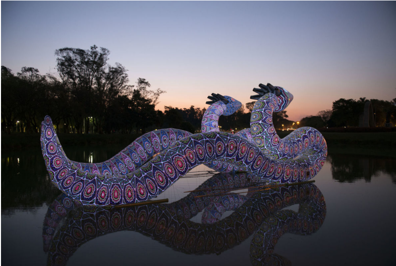
Figure 1.1. Entidades [Entities] (2021) by Jaider Esbell at the 34 th São Paulo Art Biennial.

Among Esbell's artwork is Entidades (Figure 1.1), an installation of two 17-meter-long and colourful inflatable serpents. In Makuxi cosmology, the snake is a force for healing, regeneration, and transformation (Scarparo, 2021). On the waters of Ibirapuera Park outside the 34th São Paulo Art Biennial, the snakes float in front of the sculpture of Pedro Álvares Cabral, located on the other side of the lake. Cabral was a Portuguese explorer who is generally credited with discovering Brazil in 1500. The snakes also dialogue with the Ciccillo Matarazzo Pavilion, the headquarters of the São Paulo Biennial Foundation designed by Oscar Niemeyer, a Brazilian architect who became known worldwide as one of the key figures in the development of Modernist architecture (Turner, 2022). In addition to Entidades ' confrontational meaning – i.e., of challenging western praxis to hail own (or colonizer's) interpretation of history and appreciation of culture and art – Esbell also intended for his work to engage cosmologies and mythological figures outside the narrative of European Christianity, questioning the prominence of western religion in the contemporary world. According to Esbell, Entidades “is a reminder that all original peoples have their gigantic creatures, their importance, their semiotic signs, their entities that protect and care [for them]” (Artforum, 2021).