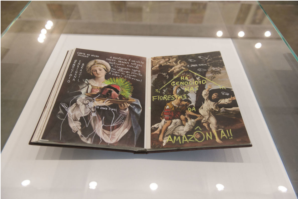
Figure 1.2 Carta ao Velho Mundo [Letter to the Old World] (2019) by Jaider Esbell at the 34 th São Paulo Art Biennial.

Carta ao Velho Mundo (Figure 1.2) is another example of Esbell's critique of the power dynamics perpetuated by the colonial legacy of art history. Through his interventions onto the 396 pages of the book Galeria Delta da Pintura Universal (Valsecchi, 1972), an illustrated encyclopaedia of the western art history, Esbell shed light on the ongoing struggles faced by Indigenous communities. The showcased pages in Figure 1.2, exhibited at the 34 th São Paulo Art Biennial, display Esbell's interventions on 17th century Italian Baroque paintings using acrylic markers. On Guido Reni's "Salome with the Head of Saint John the Baptist", Esbell drew a headdress and tribal markings. Adjacent to Salome's head, the text reads: "Violence is a long cycle. Old orders continue to echo and have now reached the world's last virgin forests. The order? Exterminate!". On Domenichino's "The Martyrdom of Saint Peter", Esbell intervened with small birds into the trees and the text: "There is genocide in the Amazon forests."