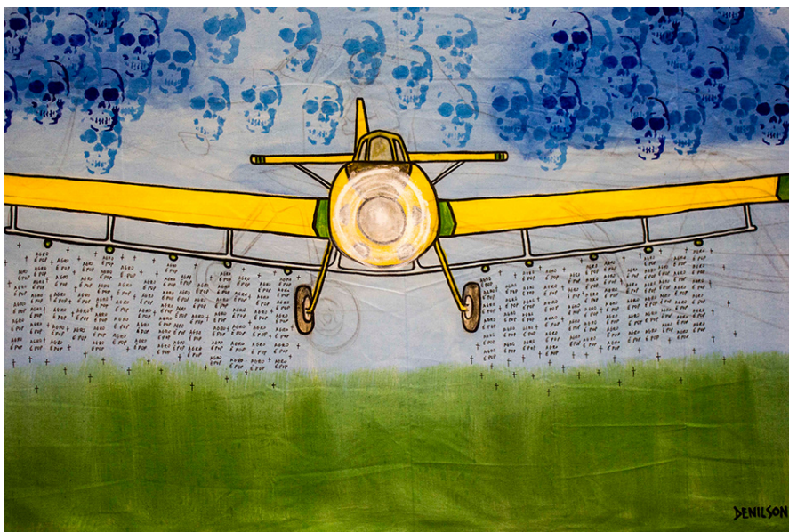
Figure 3.2 A Terra Envenenada e com Odor de Morte [The Poisoned Earth with the Smell of Death] from the series Terra Brasilis: o Agro não é pop! [Terra Brasilis: Agro is not pop!] (2018) by Denilson Baniwa. Source: https://www.behance.net/denilsonbaniwa (Accessed 7 July 2023)

As reflected in Ficções Coloniais , a central intention of Baniwa’s reanthropophagy is to appropriate the western visual language into Indigenous terms to “rewrite Brazil through art” (Sneed, 2021), contributing to the creation of a more diverse portrayal of national history.